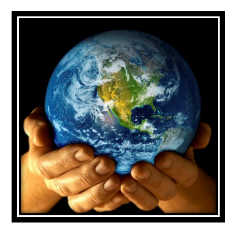
Practice based knowledge