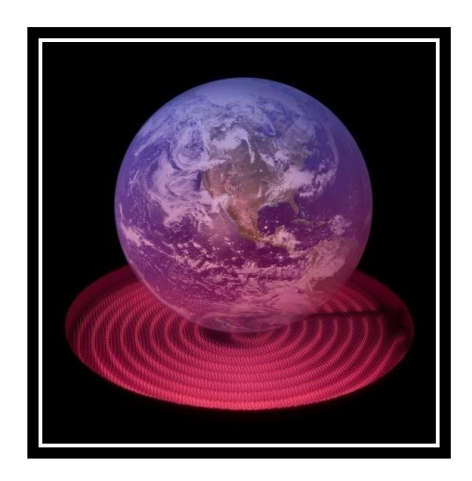
Research based knowledge

The term 'knowledge' implies status or a warrant; in the context of policy making for school improvement it implies concepts, approaches, phenomena and skills that have been proven to work, usually in a range of contexts and for a significant number of people. In most education systems higher education institutions are seen as a key source and purveyor of warranted knowledge, drawing from their own and their colleague's education research. But teachers within higher education institutions, like their colleagues in schools also draw on other warrants, on the systems and policies that shape work in their institution, on the views of recognised thought leaders, on often tacit custom and practice and above all on their own internalised values, beliefs and assumptions and experiences. To use a metaphor, research based knowledge could be considered as a globe representing the earth spinning in space and practice based knowledge as the same globe being supported by a pair of hands. Research based knowledge, like the globe spinning in space, draws heavily on multiple cases and structures for reliability and validity to create something independent; something usable in multiple contexts and therefore context free. Practice based knowledge addresses the same phenomena but recognises their boundedness to context; it is a more human phenomenon dependent on the people who enact it; those whose very act of holding the globe hides some part of it from scrutiny.