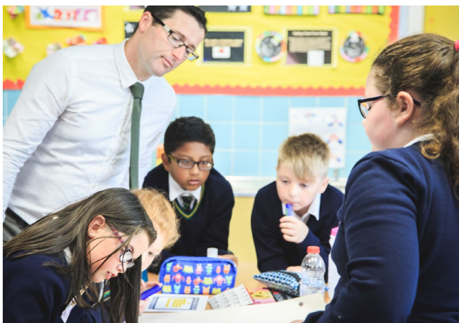
School leader observes film and literacy work in the classroom