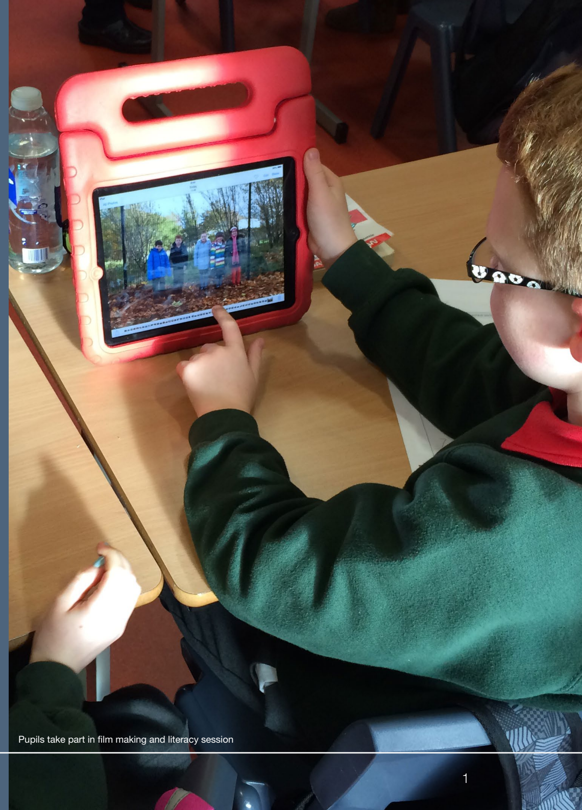
Pupils take part in film making and literacy session

“The best continuing professional development I have ever experienced – the staff (leading and taking part in training) were all so supportive. I cannot even begin to put into words how much using the rehearsal room techniques has inspired, motivated and engaged the learners in my classroom”