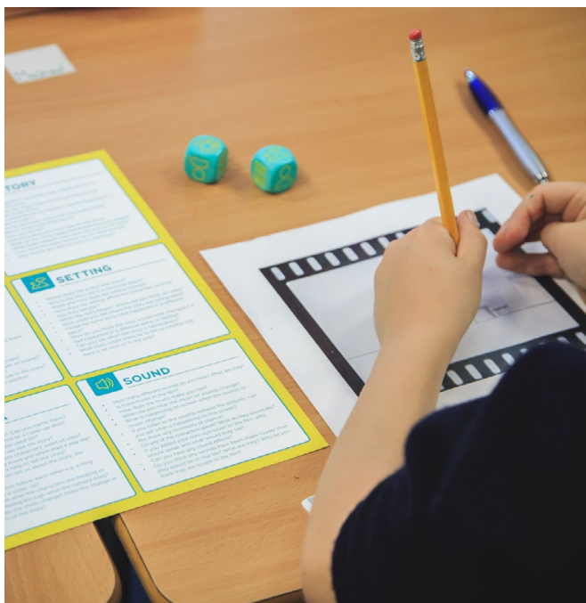
Pupils work on storyboarding their own film