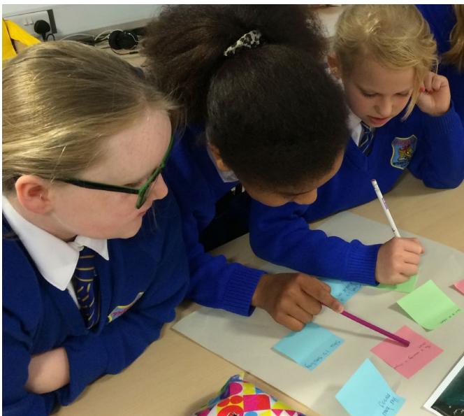
Pupils work in a group to explore inference, deduction and prediction during a literacy lesson

Learning across the first year of the pilot programme has been built into the TDF's expectations of the projects as they move into Year 2. The ongoing evaluation activities will also inform the roll-out of the programme as it expands beyond the pilot phase.