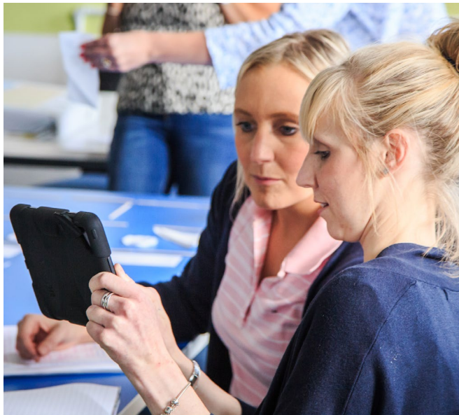
Teachers receive film making training during Into Film and Nerve Centre's first development day in Northern Ireland

The TDF pilot programme was launched for the academic year 2016–17, incorporating seven projects from across the four home nations. A second pilot year for six of the original projects began in September 2017, in preparation for the roll-out of the Fund in 2018–19. During this pilot period, the Centre for the Use of Research and Evidence in Education (CUREE) was contracted by PHF to ensure that evaluation was built into the programme through a robust research framework. CUREE have fed back ongoing learning to project participants throughout the pilot through progress reports and national sharing events where projects come together to discuss their learning and celebrate their successes. This report summarises key findings from this formative evaluation activity.