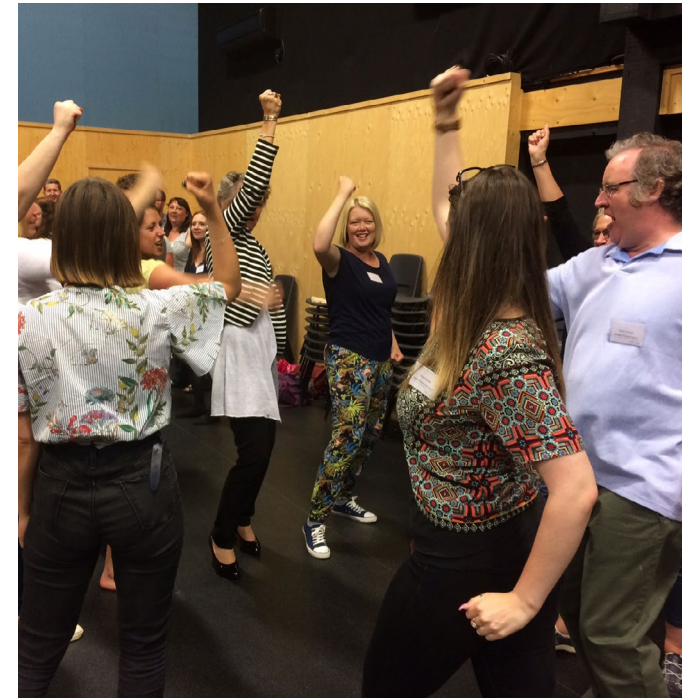
Teachers explore rehearsal room pedagogy with Royal Shakespeare Company and IVE